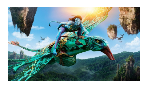
To tame his own dragon by connecting to its Spirit

Finally, being relatively limited in our movements during the adaptation of our organism to the ketogenic diet, we discovered that the predator deprived of any artificial intake of carbohydrates had the advantage -although its transdimensional "STS" predatory part was struggling with his fears through us- to let himself be gently tamed by drying our emotional at the "Service to Self – STS".