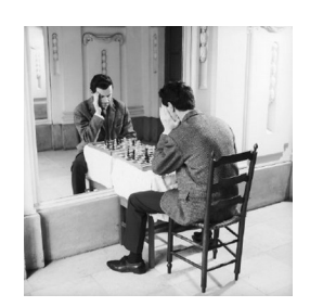
These two "STS" players represent both aspects of his predatory Spirit: evil as well as good

The two players who measure each other by means of the black or white pieces are both "STS". They are in perpetual competition for prestige, glory, recognition, to win or lose, to dominate or be submissive... symbolizing the struggle of good against evil. But this remains an experience in the third density of reality, the reality of human duality.