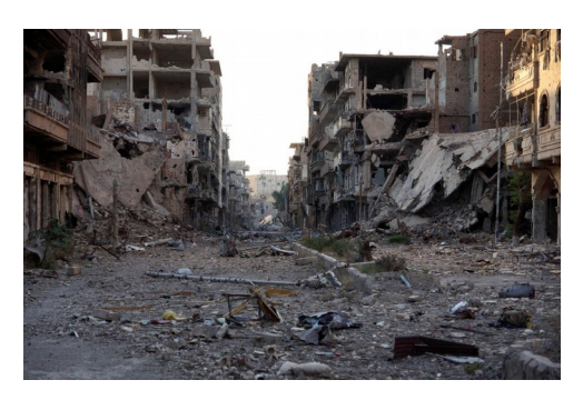
Entropic worlds are created by "STS" entities to feed on egregore of fear

As we have explained many times through our dialogues, those who create evil and perpetuate it belong to higher densities and they do so for good reasons. They thus contribute to the equilibrium of the Universe, its proper functioning and the recycling of consciousnesses that are not adapted to the Evolution in the Universe. They are sometimes and seemingly much more intelligent than humans. But often because of their bridled DNA, they do not possess an emotional and therefore cannot become creators of their own world.