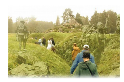
Your consciousness can sometimes be temporarily propelled in another reality.

It can also happen that your consciousness is propelled during a few moments in another reality. It is exactly what occurred during the "paranormal" experiences which you relate in the extracts of your book.