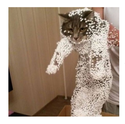
Agglomeration of particles establishing the matter (Humor... Here is how the polystyrene particles transformed into a cat!)

To illustrate it, imagine that every individual in 3<sup>rd</sup> density lives in a sort of bubble established by every type of Information.